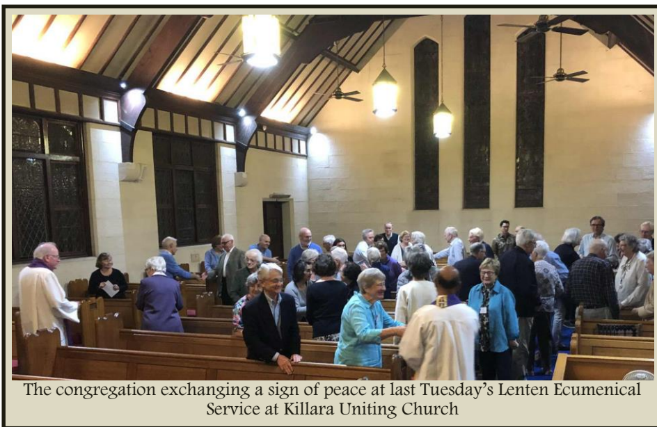
The congregation exchanging a sign of peace at last Tuesday's Lenten Ecumenical Service at Killara Uniting Church