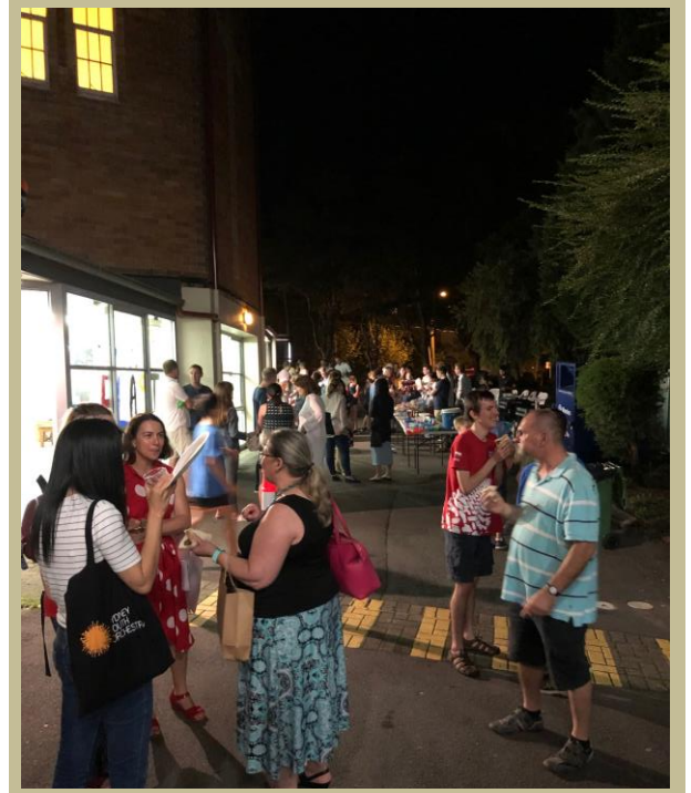
Above and to the right – the sausage sizzle following last Sunday night's Monthly Youth and Family Mass and blessing of the new youth centre ('The Basement').